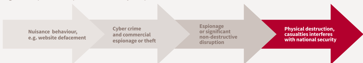
Figure 1: Spectrum of potential acts in cyberspace

Although 'cyberattack' colloquially refers to just about any malicious action in cyberspace, for the purposes of deterrence policy it must be more clearly defined. In line with existing normative practice, the term 'cyberattack' should only be used to describe an action in or through cyberspace that causes physical destruction or loss of life. 13 Other malicious acts, such as cybercrime, hacktivism and cyber espionage all fall short of this threshold of violence and complicate the application of conventional thresholds to cyberspace. The fact that cyber capabilities aren't as conveniently binary as other capabilities creates confusion over where to draw the line between what's simply a nuisance and behaviour that must be punished. However it's this grey zone of malicious cyber behaviour that also needs to be addressed in national security policy, presenting a significant challenge for policymakers.