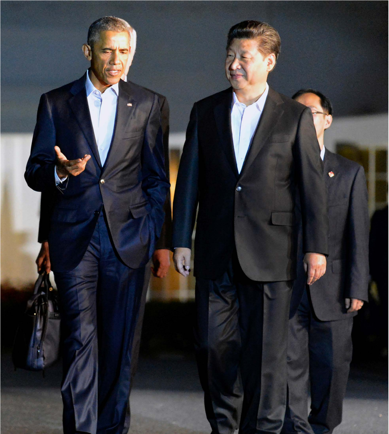
US President Barack Obama (L) chats with Chinese President Xi Jinping as they walk from the West Wing of the White House in Washington, 24 September 2015. Xi arrived in Washington for a state visit and talks with President Barack Obama expected to be clouded by differences over alleged Chinese cyber spying, Beijing's economic policies and territorial disputes in the South China Sea.